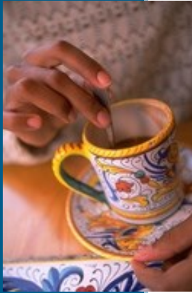
Coffee, Tea other Special Treats!

Teacher appreciation week is the first week of May. It has been a tradition that the PTA works with families to express their gratitude for teachers throughout the week. If you are interested in contributing to this event in kind or service, please contact the PTA.